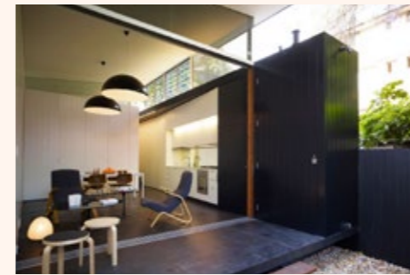
XX Street name, Suburb Sold for $X,XXX,XXX

Lorem ipsum dolor sit amet, consectetur adipiscing elit. Maecenas pellentesque, tortor vitae euismod auctor, quam enim ultricesetus, ac dictum leo lacus at massa. Suspendisse potenti. Ut fermentum elementum consectetur. In sed sodales erat. Integer diam nibh, ullamcorper et ultrices ut, convallis at eros. Pellentesque mollis quis massa nec entum.