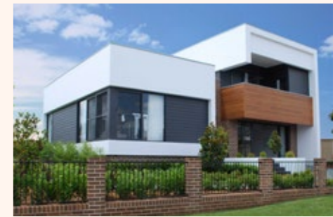
XX Street name, Suburb Sold for $X,XXX,XXX

Lorem ipsum dolor sit amet, consectetur adipiscing elit. Maecenas pellentesque, tortor vitae euismod auctor, quam enim ultricesetus, ac dictum leo lacus at massa. Suspendisse potenti. Ut fermentum elementum consectetur. In sed sodales erat. Integer diam nibh, ullamcorper et ultrices ut, convallis at eros. Pellentesque mollis quis massa nec entum.