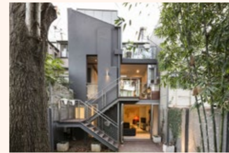
XX Street name, Suburb Sold for $X,XXX,XXX

Lorem ipsum dolor sit amet, consectetur adipiscing elit. Maecenas pellentesque, tortor vitae euismod auctor, quam enim ultricesetus, ac dictum leo lacus at massa. Suspendisse potenti. Ut fermentum elementum consectetur. In sed sodales erat. Integer diam nibh, ullamcorper et ultrices ut, convallis at eros. Pellentesque mollis quis massa nec entum.