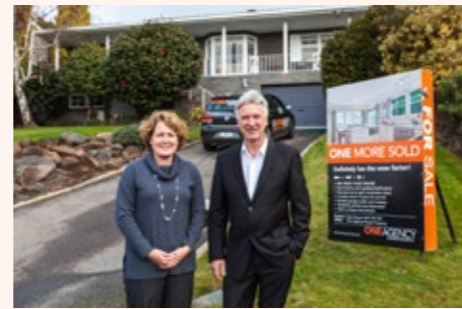
XX Street name, Suburb Sold for $X,XXX,XXX

Lorem ipsum dolor sit amet, consectetur adipiscing elit. Maecenas pellentesque, tortor vitae euismod auctor, quam enim ultricesetus, ac dictum leo lacus at massa. Suspendisse potenti. Ut fermentum elementum consectetur. In sed sodales erat. Integer diam nibh, ullamcorper et ultrices ut, convallis at eros. Pellentesque mollis quis massa nec entum.