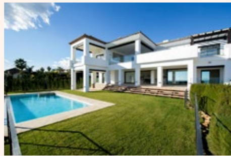
XX Street name, Suburb Sold for $X,XXX,XXX

Lorem ipsum dolor sit amet, consectetur adipiscing elit. Maecenas pellentesque, tortor vitae euismod auctor, quam enim ultricesetus, ac dictum leo lacus at massa. Suspendisse potenti. Ut fermentum elementum consectetur. In sed sodales erat. Integer diam nibh, ullamcorper et ultrices ut, convallis at eros. Pellentesque mollis quis massa nec entum.